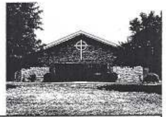
Holy Trinity - Cherry