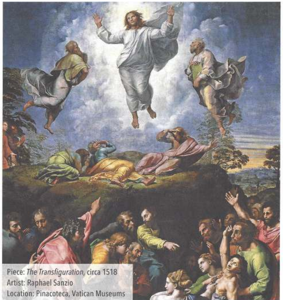
Piece: The Transfiguration , circa 1518 Artist: Raphael Sanzio Location: Pinacoteca, Vatican Museums

Here is where we need the power of God's mercy and love. Peter wanted to stay in Christ's presence and enjoy it, soak it up, remain, and never go down the mountain again. He heard the Father's voice, knew he should listen to the Son, and was resolved to do so! Although